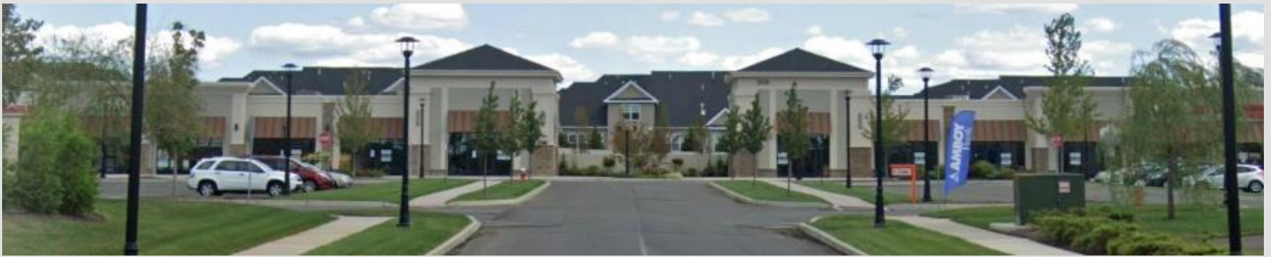
Applegarth Road Entrance