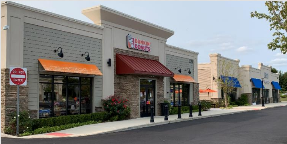
Dunkin' Donuts / Urgent Care